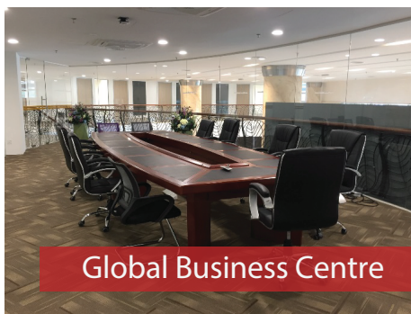
Global Business Centre